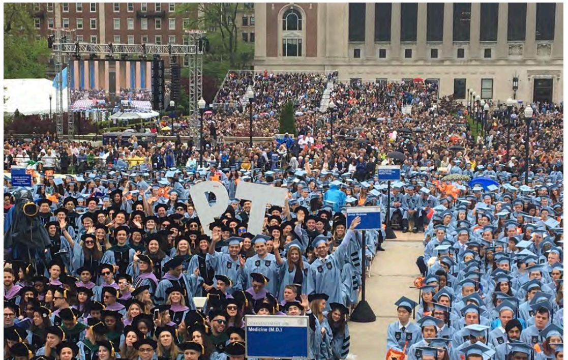
View of the University Commencement (and our Periodontics students) from the faculty dais.