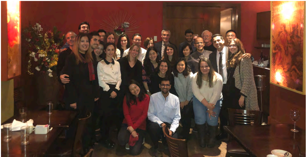
At our Holiday Party earlier this month, post-doctoral students, staff and faculty joined to celebrate and exchange good wishes!